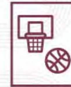
Half Basketball Court