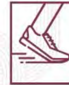
Jogging/ Bicycle Track