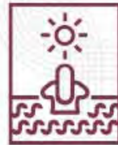
Infinity-edged Swimming Pool